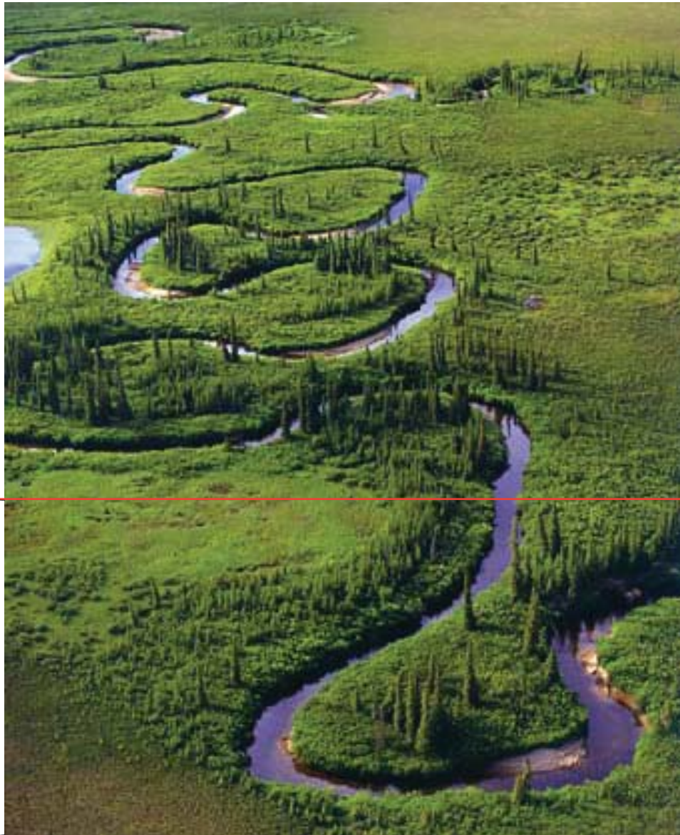
A meandering river