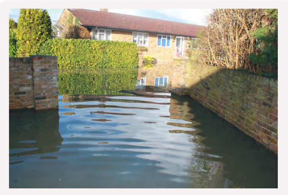
Figure 4 The flood waters at Thorpe near Staines

throughout early February, it seemed inevitable that problems would occur. By early morning on 10 February much of Wraysbury was completely engulfed by water, whilst Datchet had been severely hit by flooding with water levels rising over half a metre in 24 hours, blocking roads and railway lines. Many parts of Staines fared little better, with the river bursting its banks and sending floodwater into many parts of the town, forcing people to evacuate their homes.