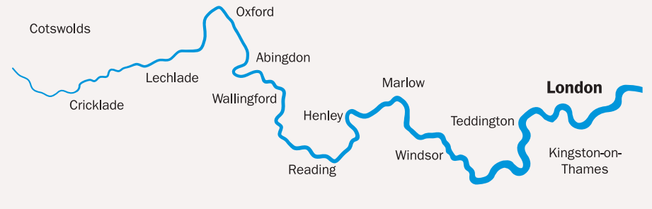
Figure 2 The River Thames

Wraysbury is a village on the River Thames, about midway between Windsor and Staines-upon-Thames (Figure 2), with a population of about 3500 people. It is a picturesque village, centred around a traditional cricket green, with many people commuting to work in London. Staines is a much larger town, with a population of just