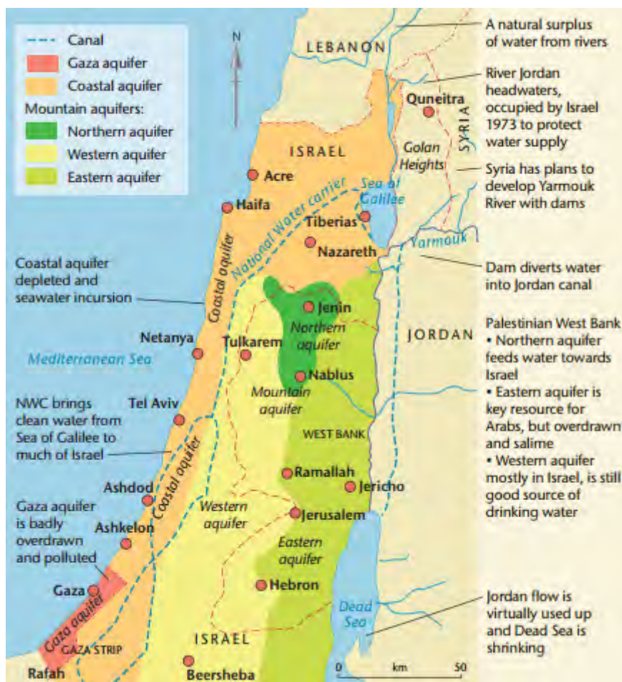
The above diagram details water conflicts in the Middle East.