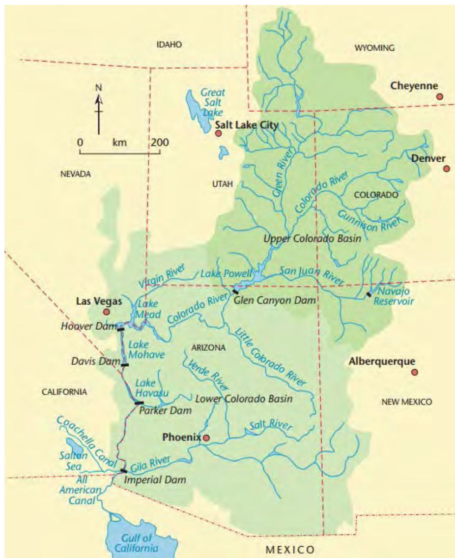
The above diagram shows the Colorado River basin and all neighbouring states.

The increasingly severe competition for whatever small quantities remain in the Colorado River keeps the basin tied up in legal disputes and controversy. Water projects must now undergo thorough environmental-impact studies in accordance with US environmental protection laws.