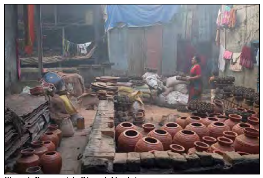
Figure 4: Pottery unit in Dharavi, Mumbai

Further pull factors include clusters of similar businesses which act as a magnet for employees, such as leather goods in Dharavi, Mumbai. Public services are easier to fund in densely populated areas. Cities therefore have better health and education outcomes which tend to increase productivity and incomes. These advantages attract more migrants. Cities fund art and culture, have an openness to science and education and display the toleration required to benefit from ethnic diversity. Creative people are attracted to cities and are associated with economic dynamism.