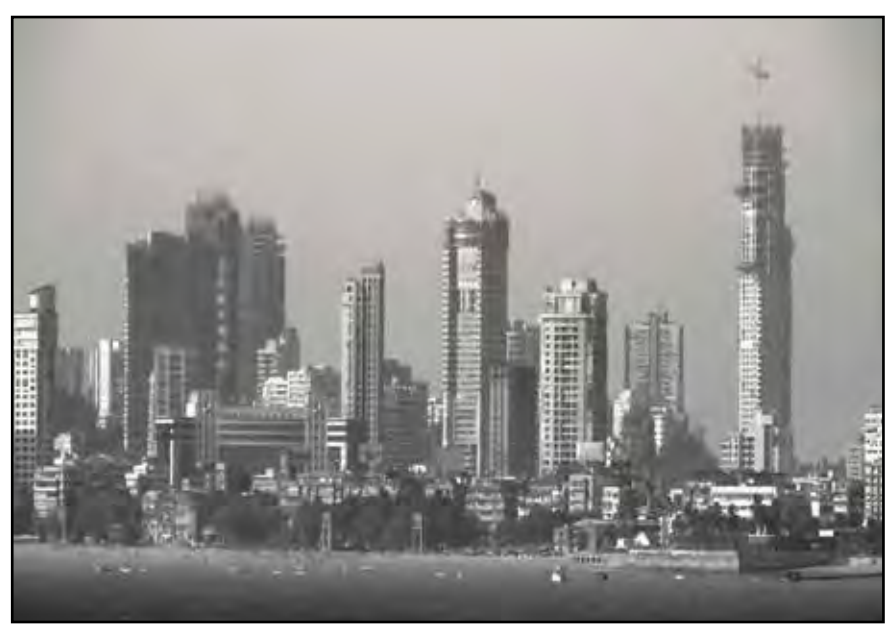
Figure 3: Mumbai skyline from Nariman point

Greater Mumbai had a population of 12,478,477 in 2011 (Government of India Census). This was 4.7% larger than in 2001, when the Census recorded a population of 11,914,398. Greater Mumbai occupies 438 km² yet the metropolitan area is almost ten times bigger at 4,355 km². The area includes outlying townships that are million cities on their own account. It is estimated that the total population of Mumbai, including the metropolitan area is 20.5m. According to the International