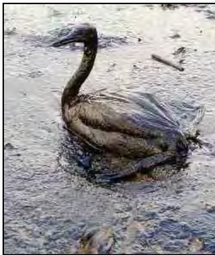
Figure 4: A sea bird severely contaminated by oil