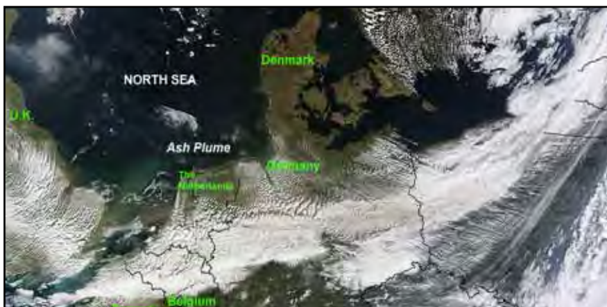
Figure 5: Satellite image of ash cloud over Europe, 16 April, 2010