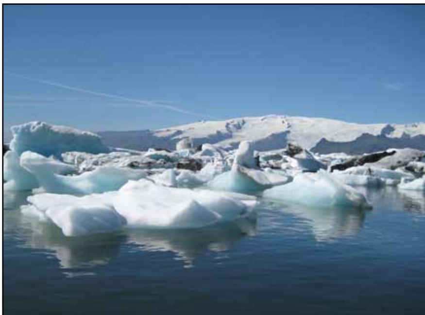
Figure 4: Glacial lagoon at Jökulsárlón with Vatnajökull in background