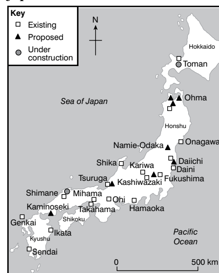
Figure 4: Nuclear power plants in Japan

cause little harm. In the longer term, however, there is an increased likelihood of cancer.