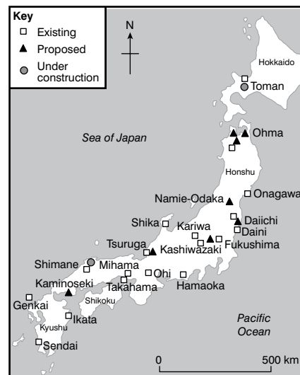
Figure 4: Nuclear power plants in Japan

cause little harm. In the longer term, however, there is an increased likelihood of cancer.