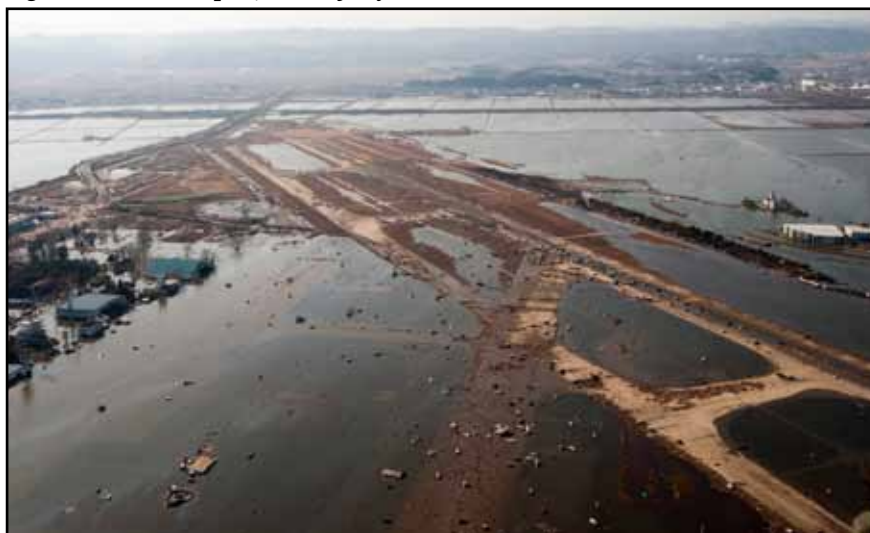
Figure 3: Sendai airport, two days after the tsunami