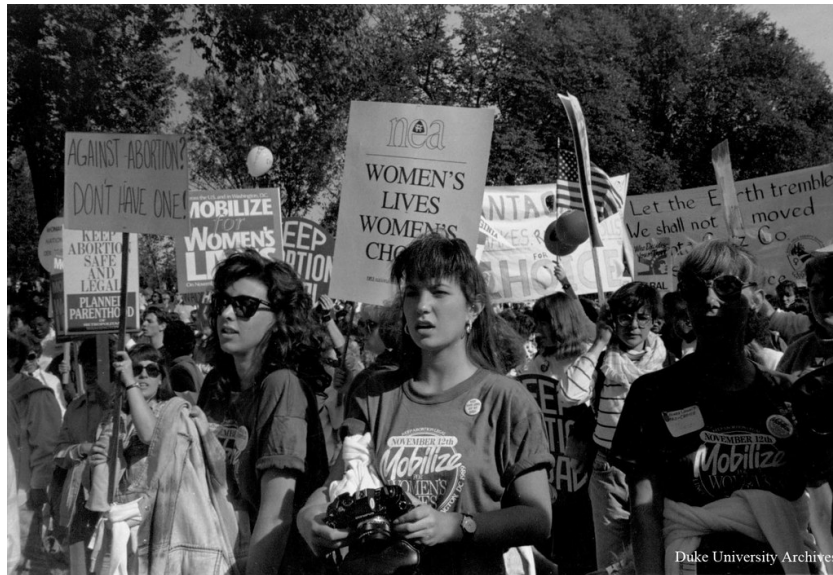
Women's Rights Demonstration, 13 November 1989