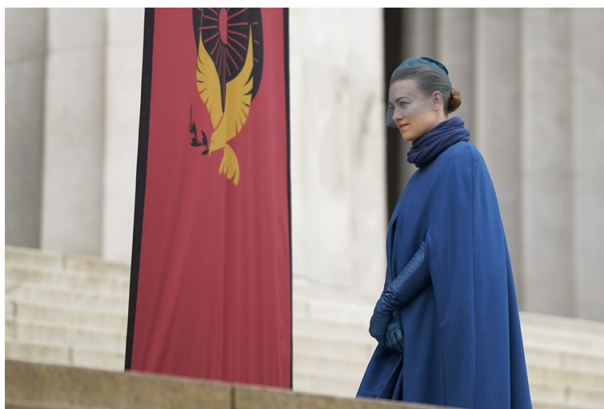
Serena Joy in The Handmaid’s Tale TV Show