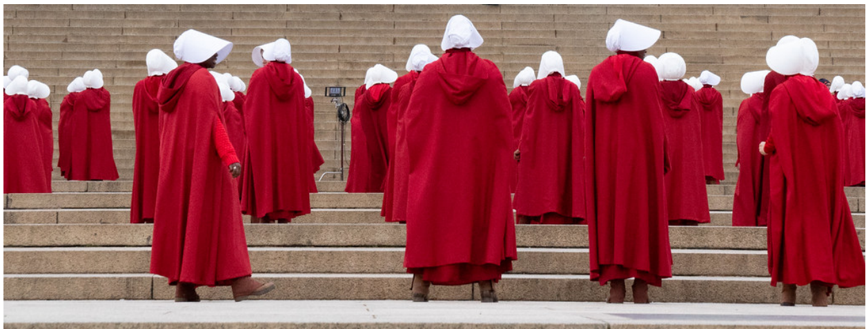
A group of Handmaids