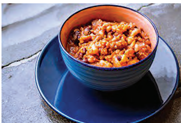
Quinoa Pumpkin Chili by All About Vegan Food.

The most common misconception out there is that you have to consume meat in order to get enough protein. This is simply not true. There may be protein in meat, but that doesn't mean that it doesn't exist anywhere else. In fact, vegans simply do what cows, pigs, sheep and chickens do; we go to the source.