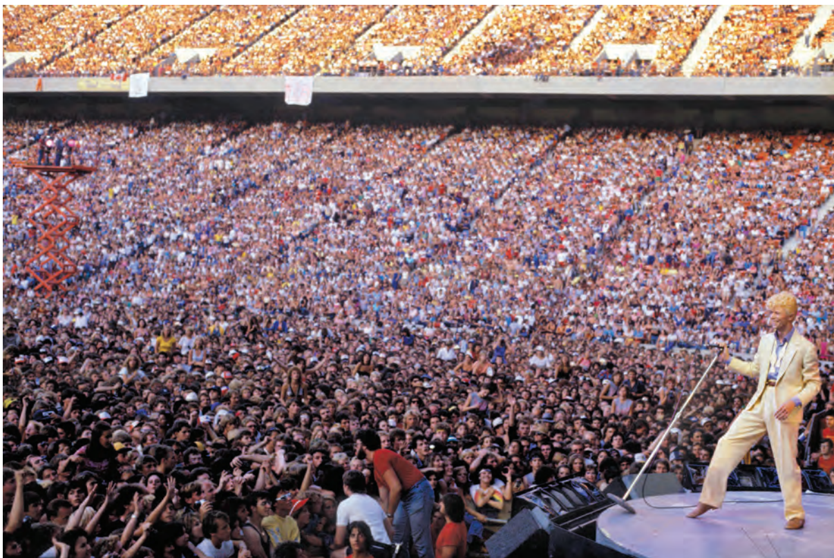
Bowie on tour in Canada in 1983