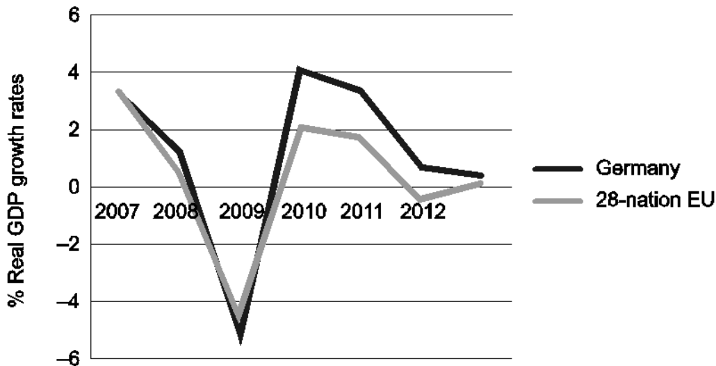
Fig.1 – A comparison of Germany and 28-nation European Union (EU) annual % real GDP growth rates – 2007–2013

Despite its relative success since 2008, German economic growth became relatively subdued in 2013. The German Federal Statistical Office said that Europe’s biggest economy grew by only 0.4 percent for the full year in 2013, less than the 0.5% analysts were expecting. This was its weakest performance since it shrank in 2009, in the wake of the global financial crisis. Despite this the economy is widely expected to pick up speed again in 2014.