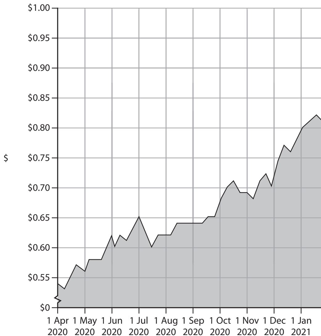
Figure 1 World price of cotton, $ per lb, April 2020 to January 2021