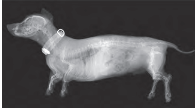
Magnification \times 0.02

Scientists have successfully used stem cells to reverse this paralysis.