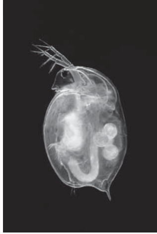
Magnification \times 20

Daphnia can be affected by pesticides in freshwater.