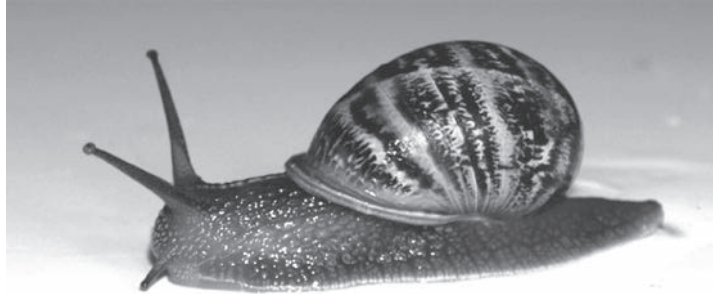
A Snail – Magnification \times 2

After repeated exposure to the same stimulus, the snail will stop responding to the stimulus. This behaviour is called habituation.