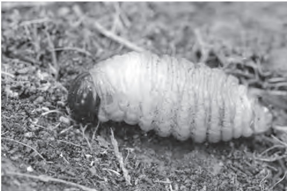
Magnification \times 10

The photograph below shows a larva of R. ferrugineus .