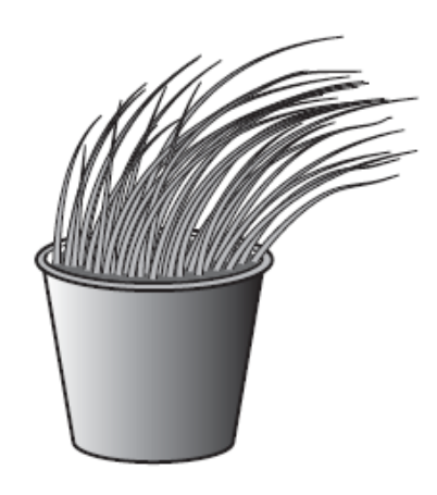
B Grass seeds grown by a window to the side